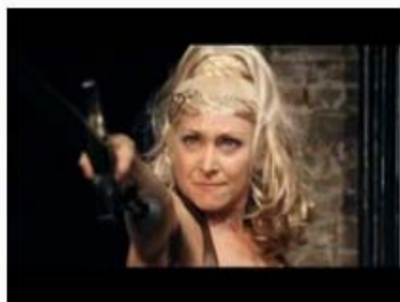
Video: FELLOWSHIP OF THE BOOBS bounces joyfully at Gorilla Tango Theatre

Here we go again, after cornering the market on shows heavy in the comedic pastie department. Gorilla Tango is extending their monopoly with a great new fantasy action adventure show. FELLOWSHIP OF THE BOOBS at Gorilla Tango Theatre brings broadswords, breastplates, baudiness, and brilliance to the Chicago Burlesque scene. You'll join Bruste Oakentits (a Dwarf), Isdra Silverbosom (an Elf), Pectus Ironchest (an Amazon Warrior) and a mysterious Fourth Companion as they journey over sea, under mountain, and right out of their semi-protective armor.